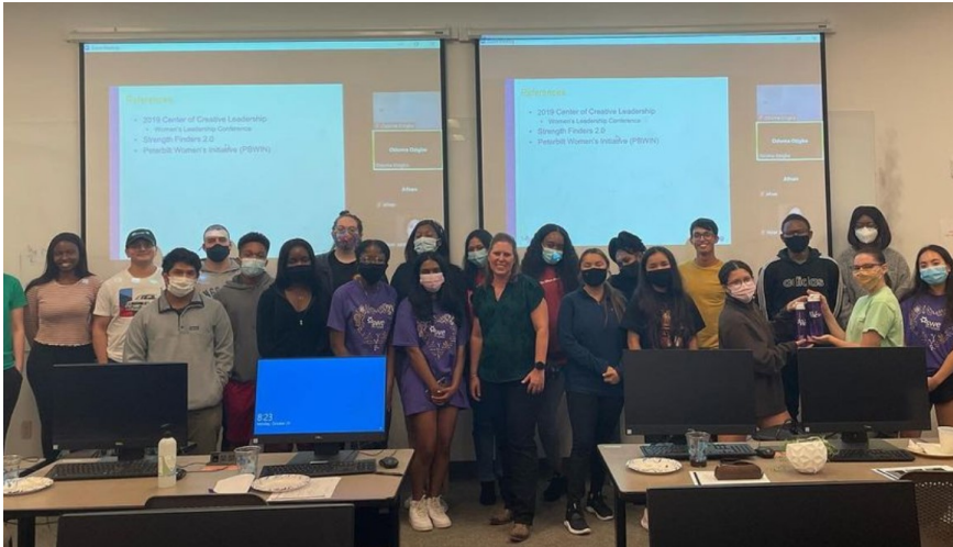
5th General Meeting with Peterbilt on October 25th

SWE UNT meets with many professionals that offer the members advice and share their experiences at the meeting. We have had speakers from many different works of life, in the aeronautical field, medical, computer science, and engineering! It is important to share their experiences so younger members know what to expect and those that have experienced the workforce know they are not alone. The meetings are a great place to connect with other women in STEM as well as gain more knowledge of the real world field and helps the transition from college to work force a lot.